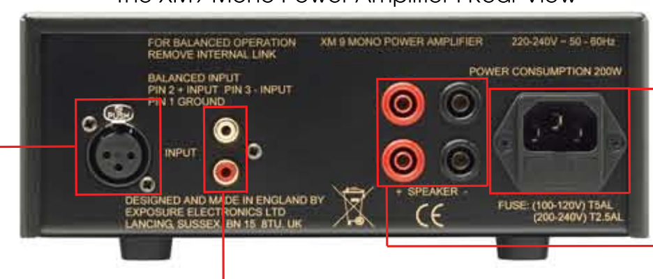
The XM9 Mono Power Amplifier: Rear View